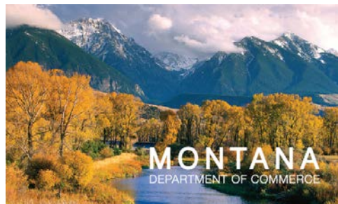
7. Paradise Valley