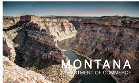
4. Bighorn Canyon